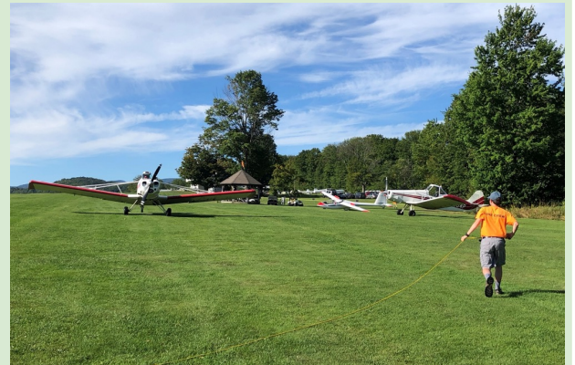
Getting ready for the next flight.