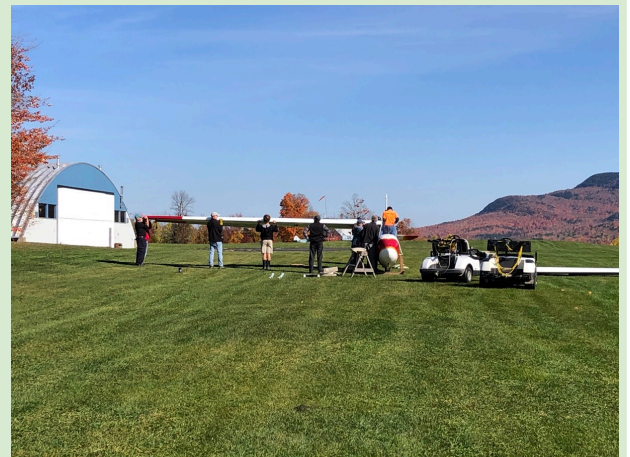
The line crew puts the airport to bed, ready for the next season!